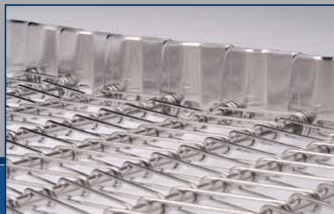
Optional: Integral side plates